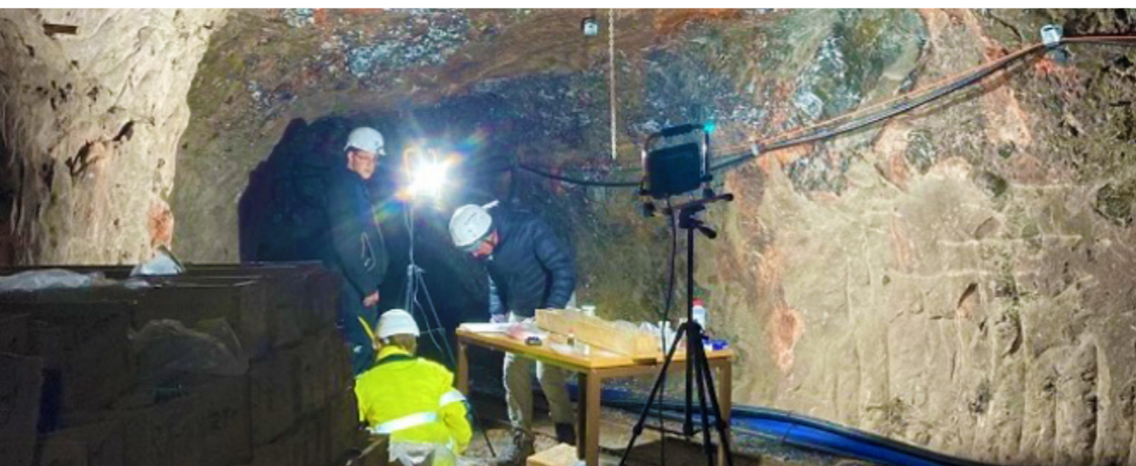
DOVE: Curation and Description of core material originating from a drill site near Bad Aussee (Steiermark, Austria) in the salt mine Altaussee (Salinen Austria AG).

ICDP projects DOVE (Drilling Overdeepened Alpine Valleys) and EGER Rift have held informal post drilling and sampling meetings in Bern (Switzerland) and at the Geothermal Research Centre Ringen in Litomerice (Czech Republic) respectively. Preparations for upcoming drilling is continuing in Denmark ( PVOLC ), in the Amazon Basin in Brasil ( TADP ) and in the Bushveld complex in South Africa ( BVDP ).