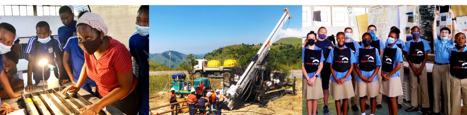
Impression from one of the BASE drillsites (center image) and activities at the BASE Outreach Center (left and right).

One ICDP project currently underway, BASE (Barberton Archean Surface Environments project) , is not only very successful in drilling and sampling, but is also very active in outreach and is well received by the scientific community. An article published in SCIENCE reports on Earth's oldest living landscape spotted in South African rock cores derived from BASE drilling in Barberton. The BASE project targets precambrian sedimentary strata, the so-called Moodies Group, in the Barberton Greenstone Belt in South Africa. With an age of about 3.22 Ga, the Moodies Group sediments are among the oldest well-preserved shallow water layers in the world. Eight drill holes, five of which have been already completed, will produce up to 500 m core from each hole.